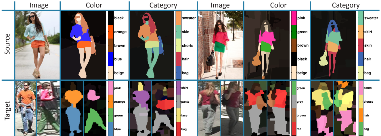
Figure 2: Visualisation of our model output. Each patch is colour-coded to show the inferred dominant attribute of two types.

in the two auxiliary datasets are combined synergistically, and weakly-annotated data can be used effectively ( f\text{-}F + w\text{-}C > f\text{-}F ); and (ii) while capable of exploiting strong supervision where available, our framework does not critically rely on it ( w\text{-}F + w\text{-}C close to f\text{-}F + w\text{-}C ; w\text{-}F close to f\text{-}F ).