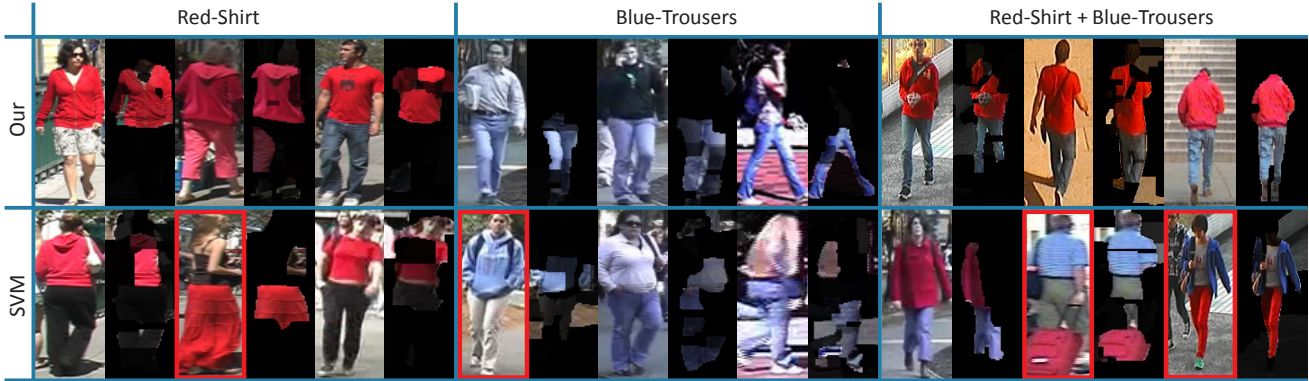
Figure 3: Person search qualitative results. The top ranked images for each query are shown. Red boxes are false detections.